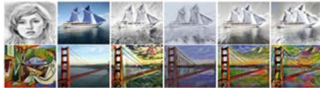
Fig. 2. Examples of style transfer results.

Fig. 2 describes the style transfer supported feature. From a content image and style reference image the goal is to create a new image which preserves the content and applies the style from a painting. The following examples are produced from a set of different methodologies described in (Huang & Belongie, 2017).