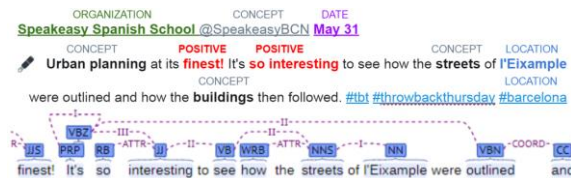
Fig. 3. Entities, emotions, and relations relevant to the urban environment use case.

The text analysis module also contains, as an additional layer, sentiment analysis, i.e., detection of the emotional polarity expressed with respect to specific entities or their aspects in the analyzed material. The association of sentiment analysis with deep-syntactic and semantic parsing results in sentiment- and semantics-aware projections of linguistic structures into knowledge graphs necessary for deep emotional understanding. Fig. 3 illustrates a partial linguistic annotation provided by the text analysis module.